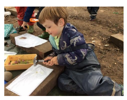
Have a lovely weekend

Please note, on the day that your child is visiting their new class or school, in order to keep everyone safe and to minimise disruption to the session they will not be able to attend their nursery session.