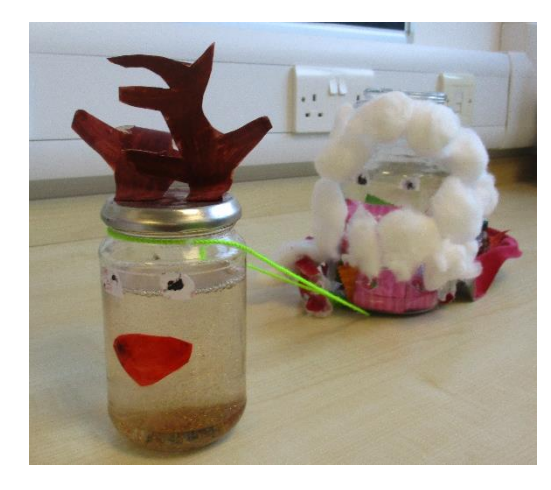
Phase 3 - Evie-May