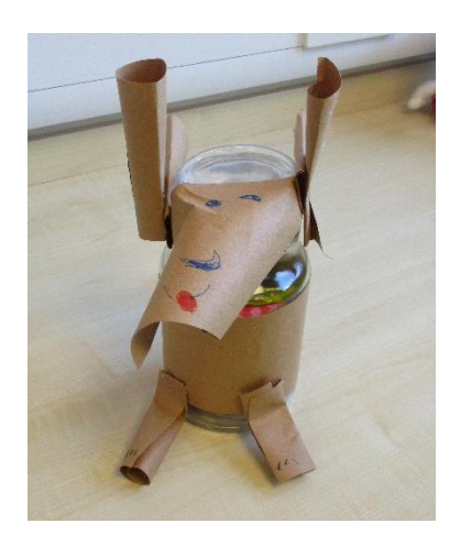
Phase 2 - Luke