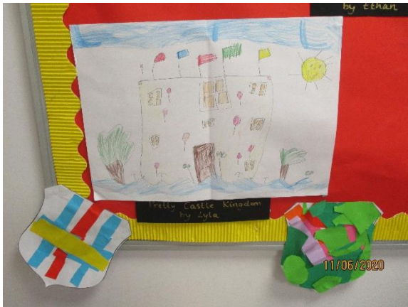
Bubble 3's wonderful displays