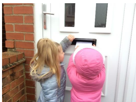
The Nursery Team

A big thank you to all the parents for their generous gifts and cards and we hope you all have a lovely family break. We look forward to seeing you all in the New Year, we will return to nursery on Monday 6th January.