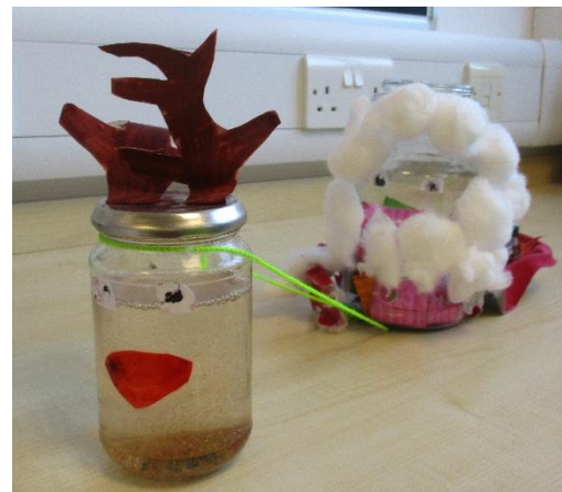
Phase 3 - Evie-May