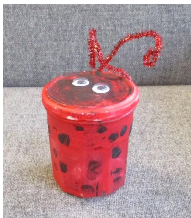
Phase 1 - Freya W