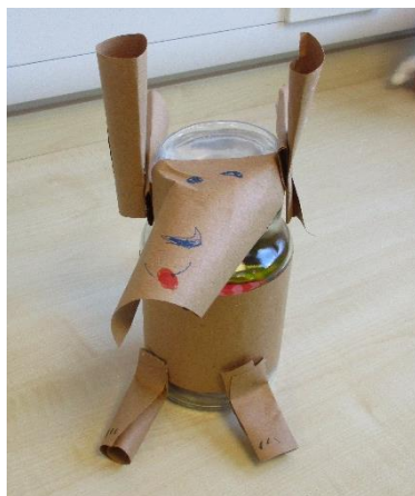
Phase 2 - Luke