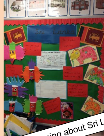
Year 3 enjoying learning about Sri Lanka

Year 1 have had a super week learning all about China. We started the week cooking and tasting food from the country (noodles and chilli sauce were the most popular!)