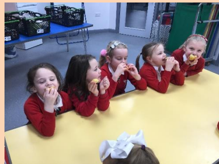
Year 2 Milne Class making Jollof rice cups from Africa