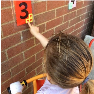
The Nursery Team

We hope you all have a lovely Easter break. Why not see how many numbers you can spot when you are out and about?